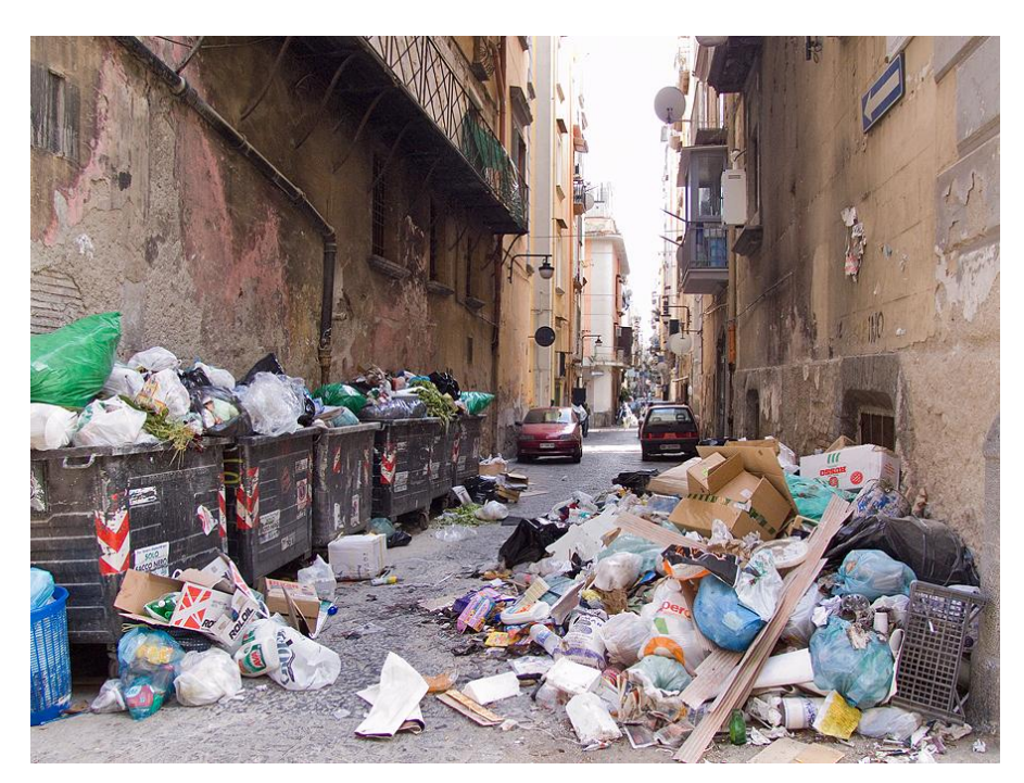
The Naples waste management crisis has lasted nearly 40 years and threatens public and environmental health throughout the Northeastern part of the Campania region, earning it the nickname, the 'triangle of death'.