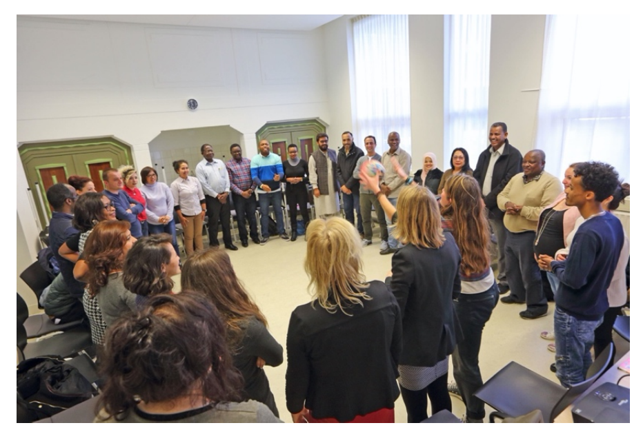
Inclusive citizen participation in decision-making processes promotes democracy and is crucial to the success of sustainability initiatives. Above, a diverse group of participants from different countries, sectors, and levels of government. discuss experiences and challenges at the Citizen Participation and Inclusive Governance course in the Hague.

This driver links to the following projects: TRANSIT, TESS, CROWD_USG, AGAPE, WWWforEurope, NATURVATION, CONVERGE, GREENSURGE, ROCK, UNALAB.