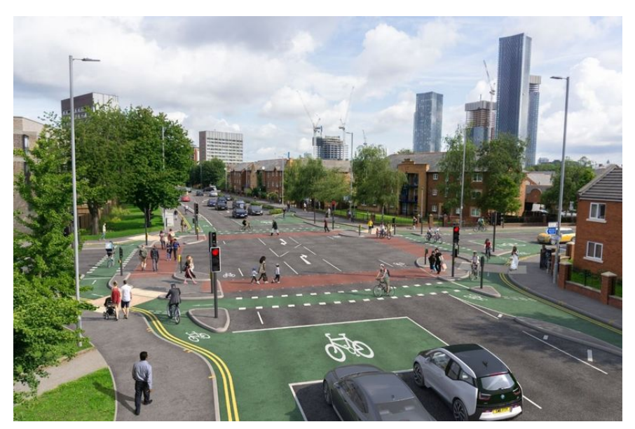
Photo by Manchester city council: A proposed cycle route of Greater Manchester, part of its £137m cycling/walking project.

Source: PATHWAYS project; Personal communication.