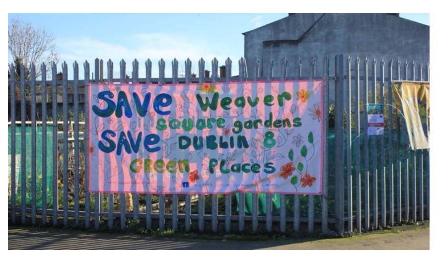
Adjacent to Weaver Square Park, the Libertines, a city-backed development project was proposed to build new housing units on land occupied by community gardens. Despite the communal value of the space, Dublin City Council called it an "emergency situation" and proceeded with the construction of council housing.