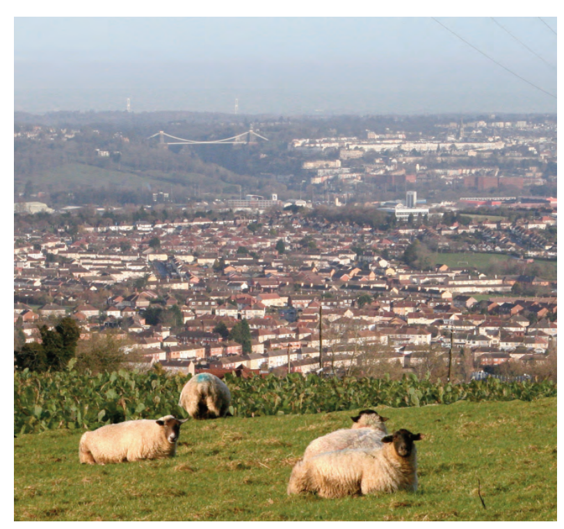
Photo by Bristol Food Policy Council. Bristol, like many cities in Europe, depends on strong institutional bodies to coordinate policies related to food security and imports. Unable to achieve full self-sufficiency, access is dependent on a globalized network and transparent collaboration.

Source: (Vadovics et al., 2012) (CONVERGE, personal communication)