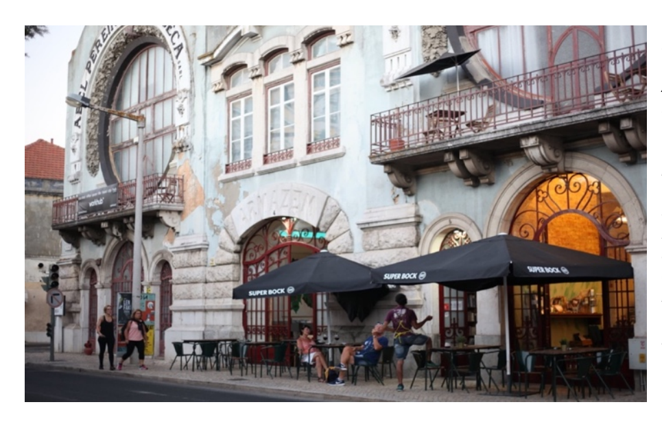
Abel Fonseca factory, in Marvila, Lisbon, was transformed into a coworking space and bar. It is across the street from Santos Lima, an apartment block that received media attention after it was sold to developers without informing the residents who had occupied the building for decades.