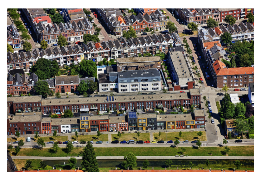
An aerial shot showing new construction in the Carnisse neighborhood, in Rotterdam, the Netherlands. Dubbed one of the worst neighbourhoods in the country, it has been targeted for numerous redevelopment and community improvement programs, including a community garden project that closed down due largely to budget cuts and state withdrawal.