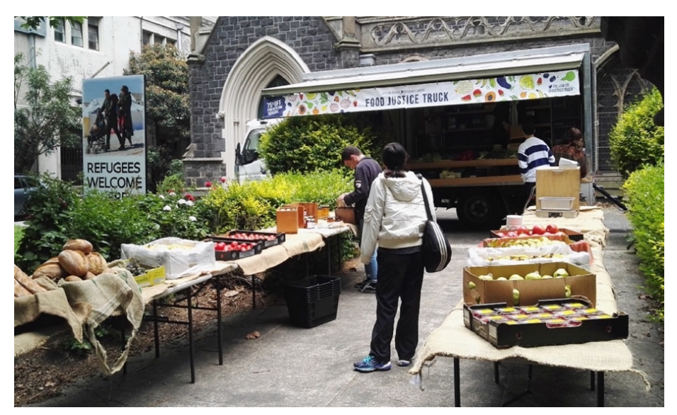
Community-based initiatives that link to sustainability efforts, such as the food-sharing program shown above, may engage with radical claims and enhance social justice, but can also be difficult to implement and sustain, thus limiting the overall impact.