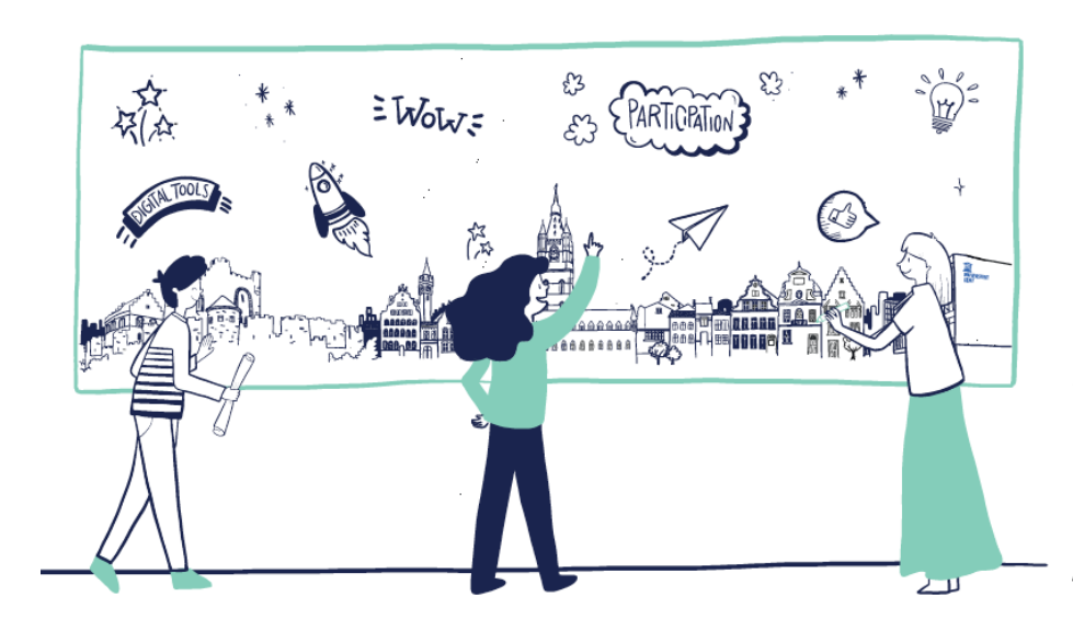
Digital and social technologies can enhance the participatory process and improve knowledge brokerage, leading to more inclusive and representative urban governance. It can also become another form of exclusion, however, if only the technologically literate have access to digital platforms (CROWD USG).